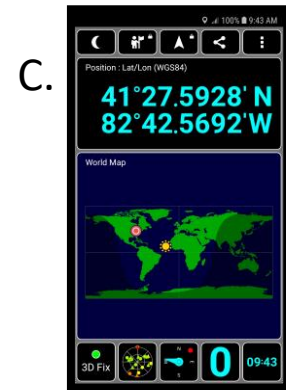
App: GPS Test

Ohio zone boundaries using three common GPS coordinate systems. Boundaries are lines of longitude.